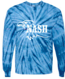
Tye Dye Shirt