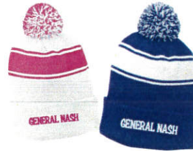
Pom Pom Hats