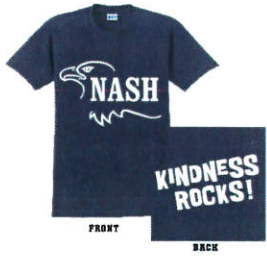
Kindness Rocks TShirt